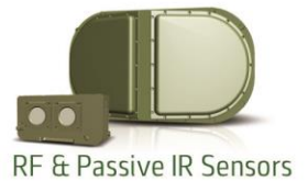
RF & Passive IR Sensors