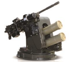
APS & RCWS Pedestal